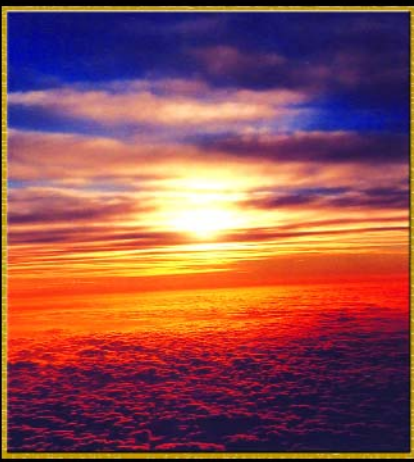
Sunrise Above the Clouds

www.collectorsguideeurekasprings.com ©2007