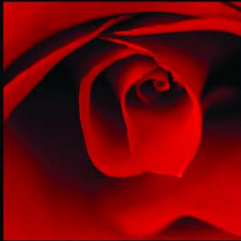
Rosa spp. 44 - Map A